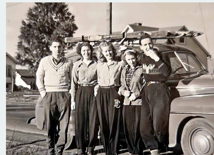
Trip to Mount Baker, 1948