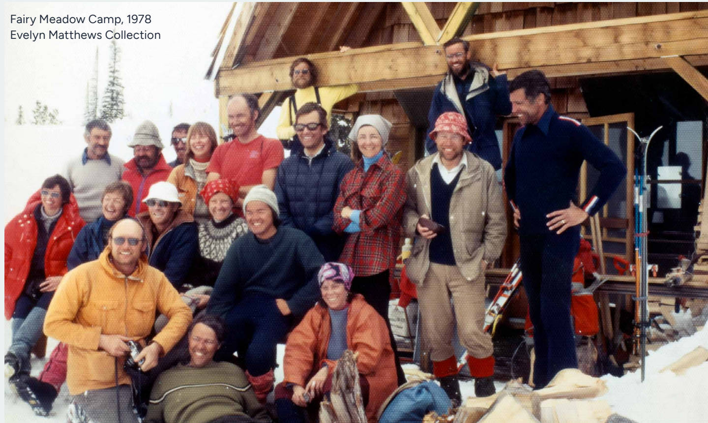
Fairy Meadow Camp, 1978

Over the decades, the ACC has established the country's largest backcountry hut system, published the Canadian Alpine Journal since 1907, championed conservation, and hosted the General Mountaineering Camp more than 110 times.