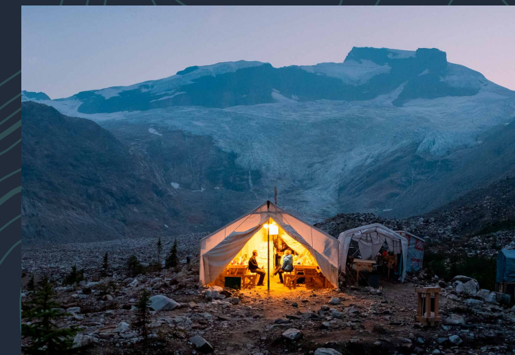
The 2018 GMC, photo by Mary

"This is my mountain benediction for all who are awe-struck by the mountains: 'If you're lucky enough to be in the mountains, you're lucky enough!' ... I consider it a privilege and a personal calling to help the ACC in promoting responsible, sustainable access to wild mountain places. After all, I don't want the luck to end with me!"