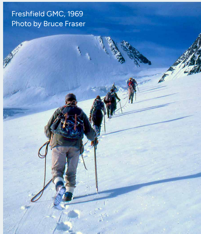
Freshfield GMC, 1969

These accomplishments were not built overnight. They were built by members—one generation at a time.