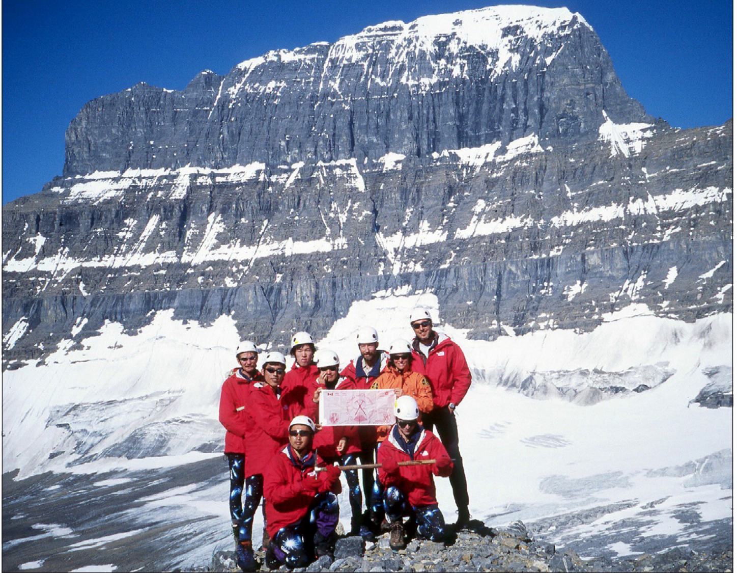
The whole gang near the Alberta hut posing with the famed Silver Ice axe and Mt. Alberta in the background.