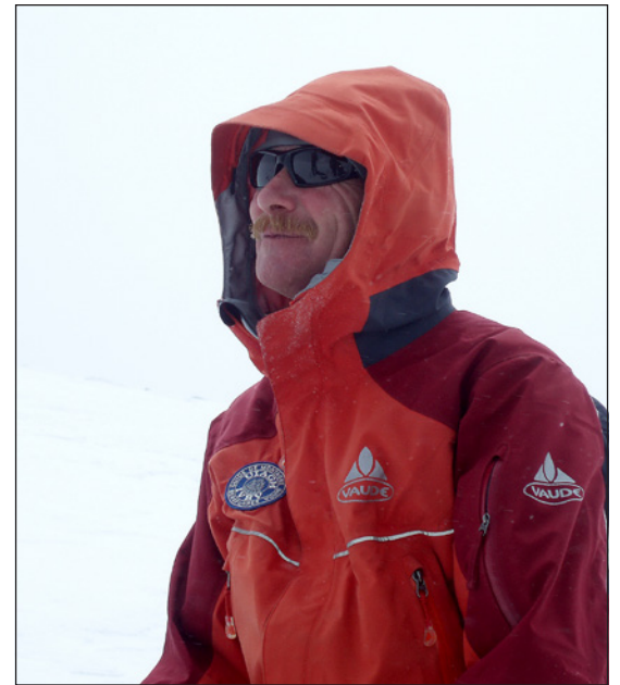
A cold day up on the glaciers above Mistaya Hut in 2005.