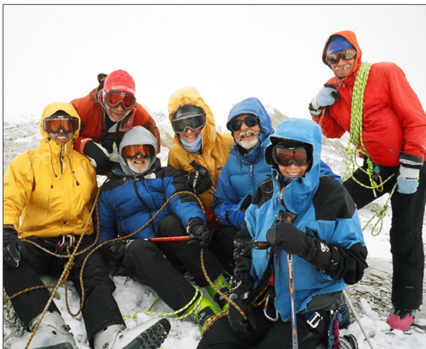
Summit of Mt. Olive, mid-to-late '90s on an Alpine Club Wapta Traverse trip.