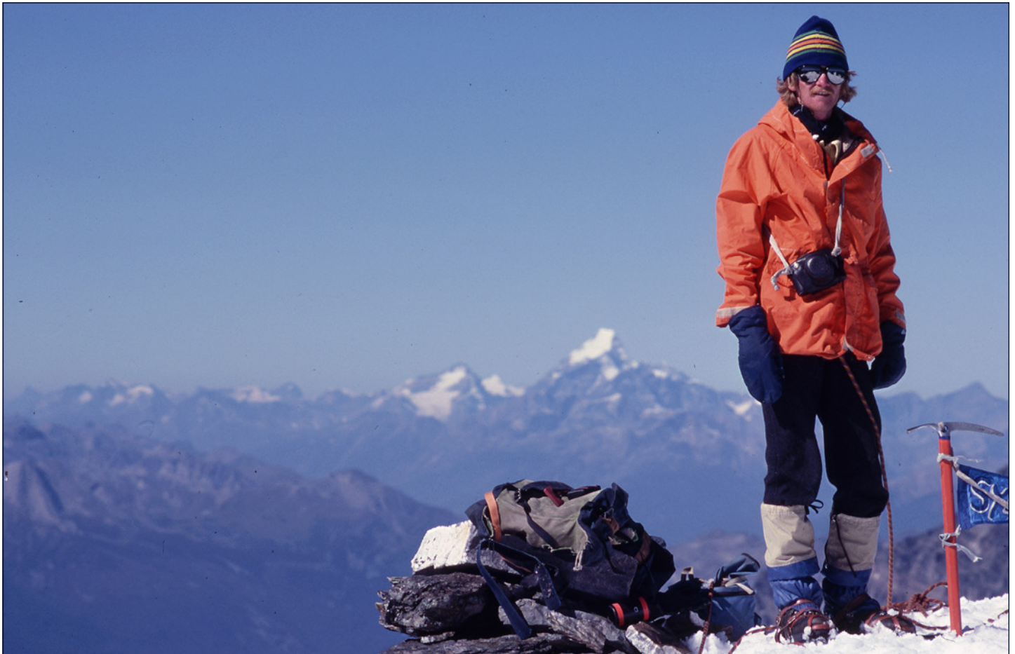
On the summit of Simon Peak in the Tonquin.